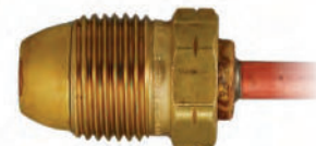
Male Hard Nose POL, 7/8" Nut