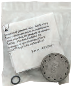
MEP1632 Kit w/ instructions

Installed in MEGR-1632 Series Full Size Twin-Stage Regulator